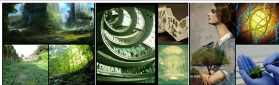
Illustration of the scenarios. Left from right: Collapse Scenario; Discipline Scenario; Transform Scenario