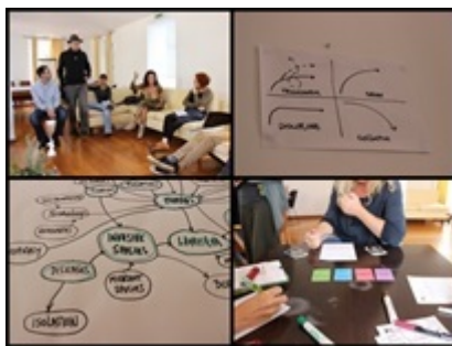
Future of Laurasilva Scenario Workshop

By having a glimpse at these future we envisage our audience to be able to make mental notes, assumptions if not even plans on how to get there, or how to avoid them or simply become aware of the multiple possibilities that life has. Since things will not remain as they are forever, it is better to take charge of the future and chose where to go or not to. Quoting William Gibson infact: “The future is already here, It is just not evenly distributed.”.