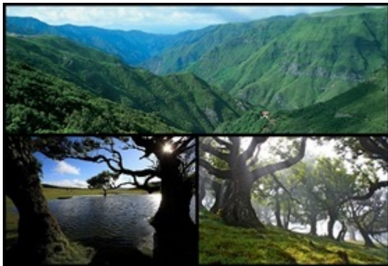
The Madeiran endemic Laurasilva forest

During the course of the two years project, at M- ITI we specifically conceived and produced three technologically mediated story artifacts, namely, Laurasilva, Yasmine Adventures, and the Dreamscope. Laurasilva was conceived as a transmedia story that would expose tourist of the Madeiran island to the rich heritage and biodiversity of the protected Laurisilva. Yasmine Adventures, is a context aware mobile story, developed in collaboration with the UDK Design Research group and the Jewish museum of Berlin, in order to connect the visitors of the museum to the surrounding neglected neighbourhood. Finally the Dreamscope, is a set of tools that complement the Lucid Peninsula installation, a truly inter disciplinary and collaborative effort of the Fabulators. Through the Lucid Peninsula future scenarios, physical narrative and context aware digitally mediated storytelling come together in an interactive and immersive installation that has already been exhibited in Austria, Romania and Scotland. The rest of the article will describe the three installation in details and reflect on them.