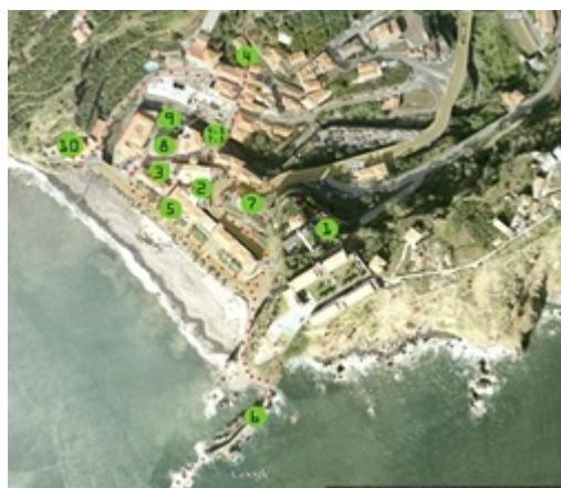
The Laurasilva Story trail to be followed by the audience through Ponta do Sol village

endemic Laurasilva forest of Madeira (See fig 1). The project takes the shape of a mobile-based, context-aware transmedia narrative that unfolds in the local village of Ponta do Sol. The audience explores the narrow alleyways in search of a lost 18th-century herbarium and the historic, cultural, and scientific knowledge it contains (See Fig.2).