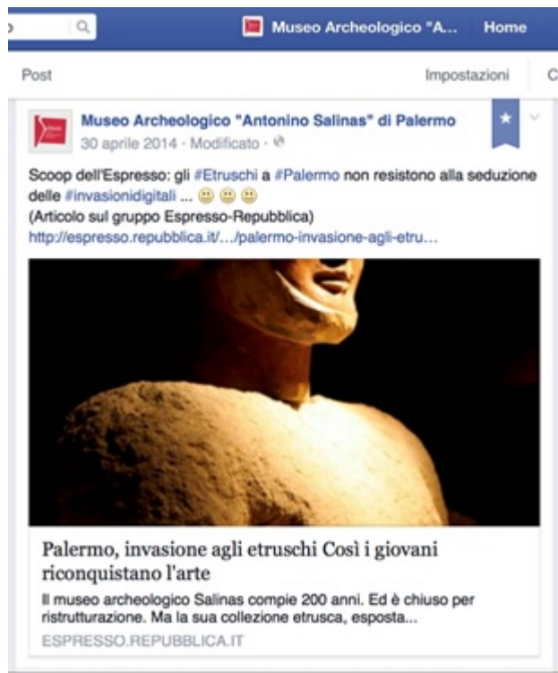
Fig. 2: Post on Facebook sharing the article published on the magazine “Espresso” of Repubblica on the “Etruscan in Palermo” exhibition’s renewed visibility.