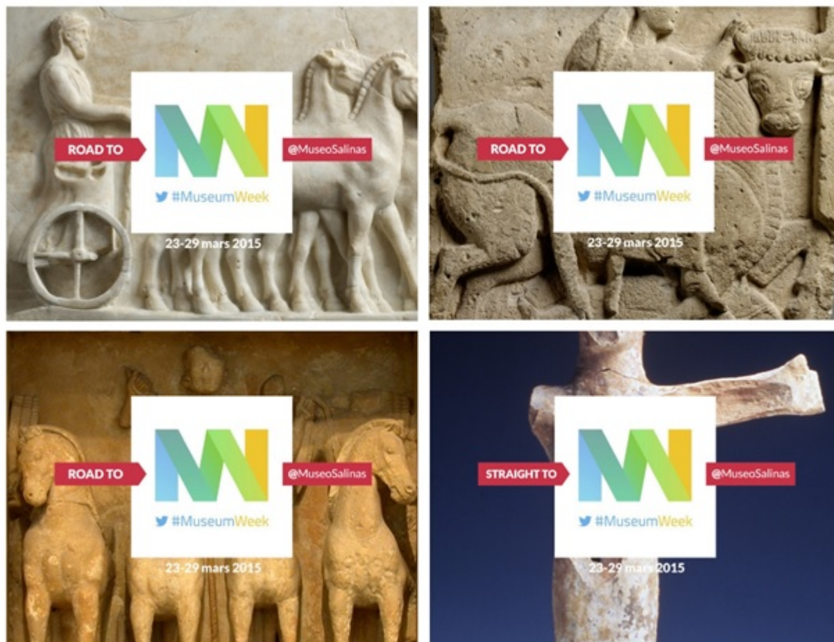
Fig.6: flier of the teaser campaign for #Museumweek2015 on Twitter